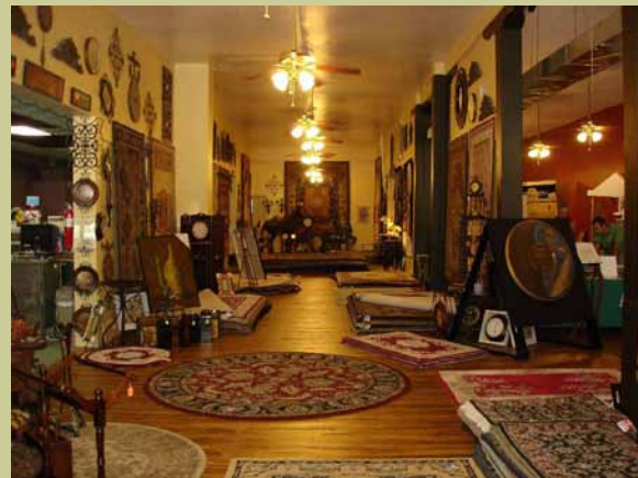
Visit our Newest Shops at 193 Fort Wayne Avenue

"You'll never know what you'll find at The Historic Gallery Shops!"