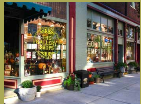
The Good Life Emporium has a new, larger location

We would also like to announce that The Good Life Emporium has moved to 193 Fort Wayne